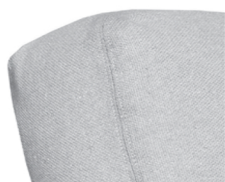
Box English Seam