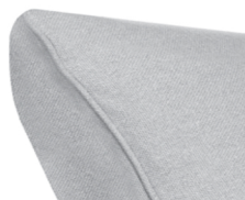
Knife Edge Welted