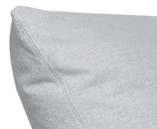
Knife Edge English Seam